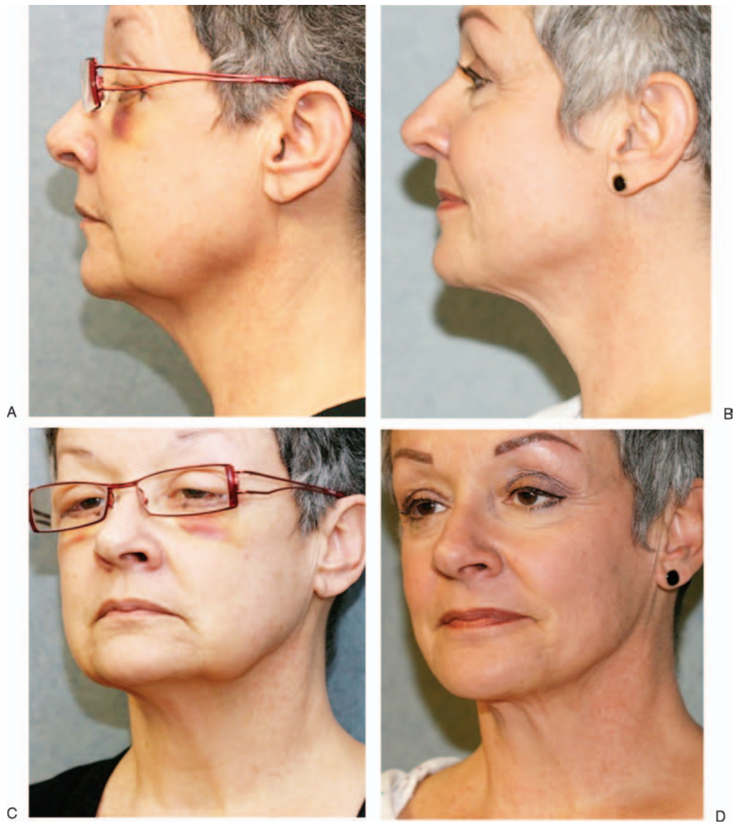
Figure 7 Three days after lower blepharoplasties, this 57-year-old female underwent laser face-lift 1 (LFL 1) with 350 mL tumescent fluid (0.15% lidocaine with 1:250,000 epinephrine) and 10 mL of 1% lidocaine with 1:100,000 epinephrine. The left and right photographs (lateral and oblique views) were obtained before and 9 months after surgery, respectively. Internal laser energy of 1064 and 1320 nm (50:50) was delivered at 5 W for each wavelength, and skin temperature was maintained between 38°C and 40°C. Aspirate included 20 mL of fat and estimated blood loss was \leq 10 mL. The patient's postoperative results at 9 months show improvement and skin tightening in the jowls and reduced submental fullness. The patient attended a class 3 days after surgery and a social event on day 4.

63-year old patient during a revision face-lift. The patient had a scar near the corner of her mouth, which flashed immediately when in contact with the laser fiber. The affected area was promptly cooled with ice, but the potential for a rapid increase in temperature was immediately apparent.