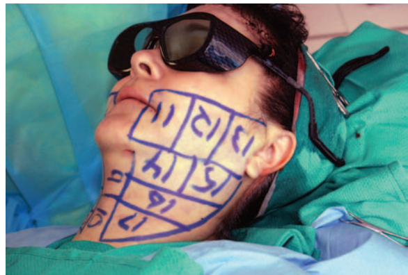
Figure 5 Grid squares on the left neck and lower face of a 54-year-old woman just before laser treatment of the grids. Each square was treated individually.

Each square was treated with the Joule (Sciton Inc., Palo Alto, CA) or the SmartLipo, using 1064/1319 nm or 1064/1320 nm Nd:YAG laser energy, respectively, delivered by an optical fiber (300, 600, or 1000 \mu m diameter) enclosed in a stainless steel liposuction cannula and extending 2 to 3 mm beyond the distal end. Fifty percent of each wavelength was used with laser power settings the same for each wavelength (e.g., 6 W