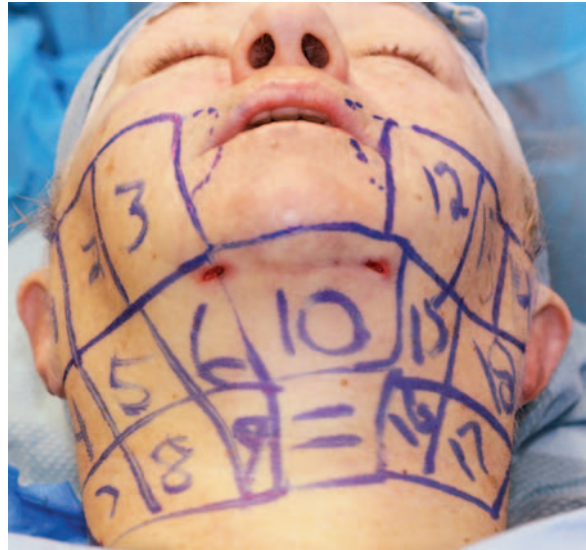
Figure 4 Grid squares (17, ~5 × 5 cm) drawn on the neck, submentum, and lower face of the 55-year-old woman after infusion of the tumescent anesthetic solution. Each square was treated individually.

ment of the 300-, 600-, or 1000- \mu m laser fiber into the lower two-thirds of the face and anterior cervical triangles. It was crucial that the tunnels permit uniform trauma and delivery of laser energy into each grid (Figs. 4, 5) as reflected in surface temperatures and that the surgeon's tactile sense be maintained during the procedure.