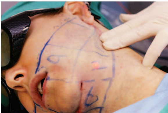
Figure 3 The cannula and laser fiber inside the neck during treatment of a 53-year-old female patient.

neck and lower two-thirds of the face. A 22-gauge, 3.5-inch spinal needle was used for the infusion. The infusion volume was selected on the basis of the degree of tumescence, anesthesia, and its anticipated effect on the temperature of the tissue during laser treatment. (It was thought in early procedures that lower volumes would have a lesser cooling effect.) Figure 1 shows a patient immediately after infusion. The face-lift solution consisted of lidocaine (750 mg, 0.15%), epinephrine (2.0 mg, 1:250,000), and sodium bicarbonate (7 mEq) in 500 mL normal saline. For incisions, lidocaine (1% with 1:100,000 epinephrine) was used. Tunnels for passage of the laser cannula were created with a spatula cannula (4 mm, 6 mm, or both) without suctioning and a Blugerman rasp (2.75 mm) to further break down septations and subcutaneous attachments. Instruments used during the procedure are shown in Fig. 2 and the cannula and laser fiber inside the neck in Fig. 3. If required, a minimal quantity of fat was aspirated for sculpting in the immediate submental and anterior cervical triangle areas. It was occasionally necessary to use the Blugerman rasp a second time to ensure place-